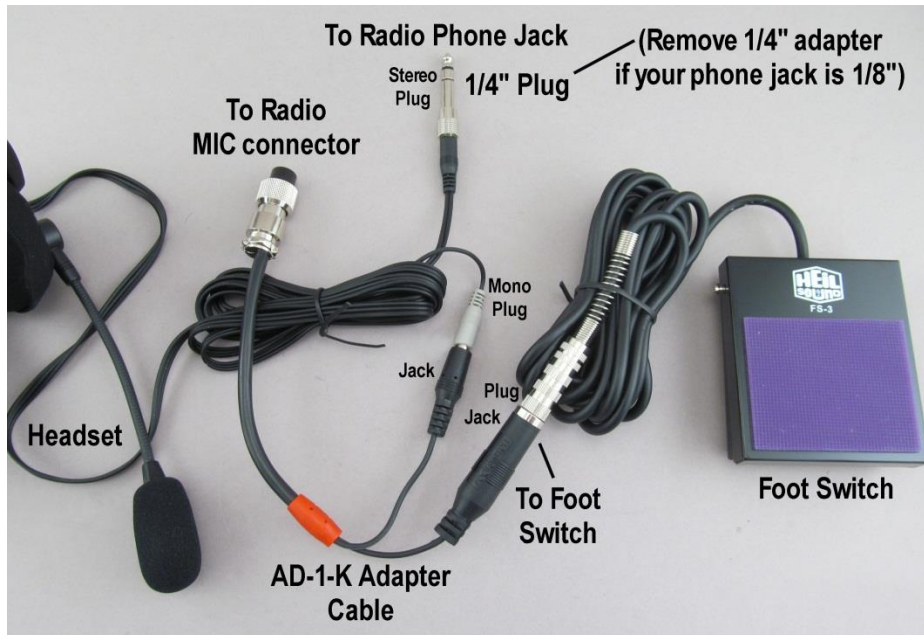
Typical Connections - Headset - Adapter Cable - Foot Switch - Radio