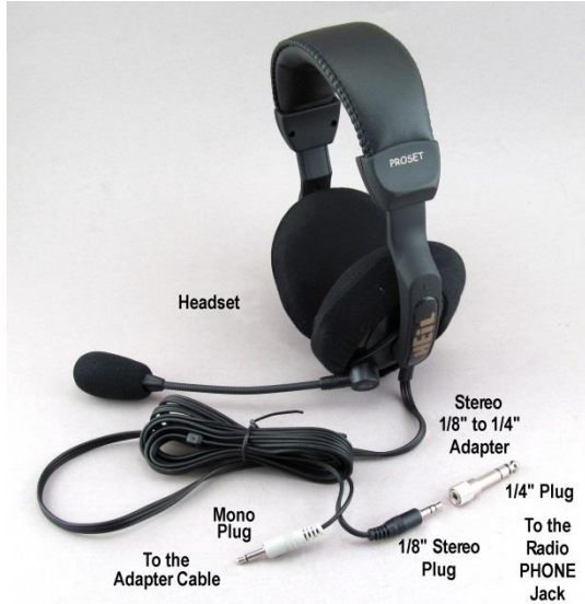
Typical Heil Pro Set

Connections to radios are similar. Depending on your radio, you need a radio specific Heil adapter cable.